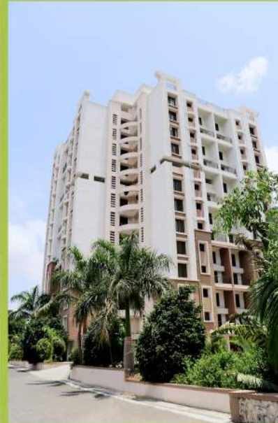
Phase 1 - Building D1