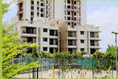
Phase 1 - Building C1