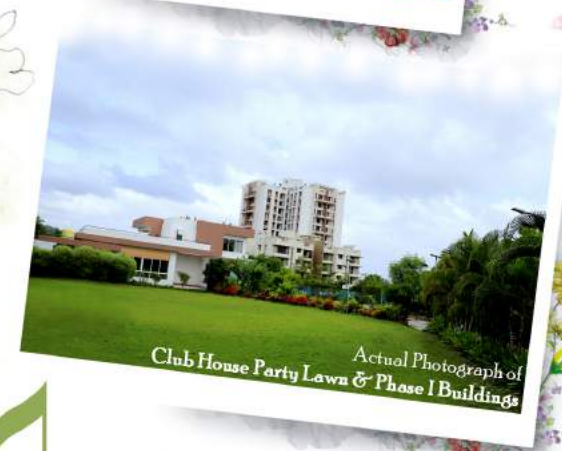
Actual Photograph of Club House Party Lawn & Phase I Buildings