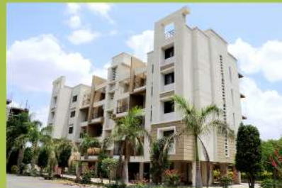
Phase 1 - Building B1