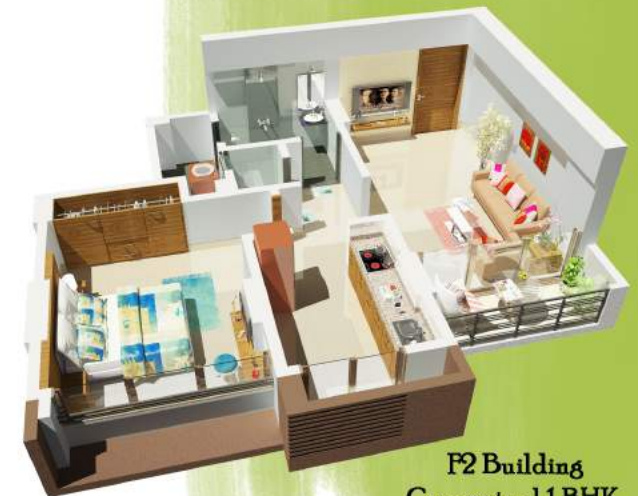
F2 Building Conceptual 1 BHK Artist's Impression