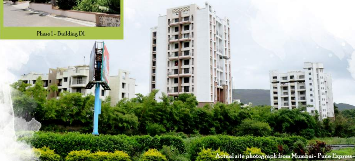
Actual site photograph from Mumbai-Pune Expressway