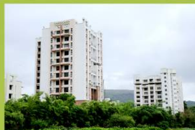
View from Mumbai-Pune Expressway