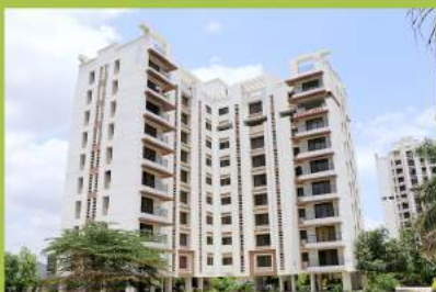
Phase 1 - Building A1